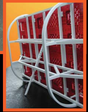
Rocker Table Back

The Slab Rocker Table designed to allow one person to handle a stone slab from A-Frame to work surface. The table can be rolled to a semi vertical position to accept the slab and is then easily lowered to horizontal for layout and cutting.