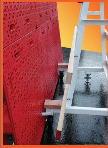
A-Frame with Brake