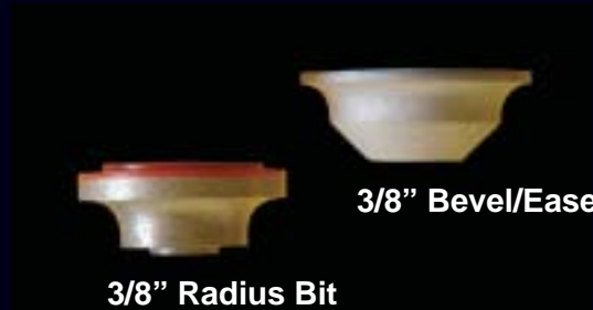
3/8" Bevel/Eased Bit